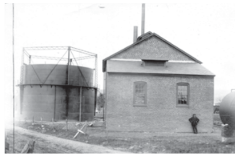
The Emaus Gas Works was located on Bank Street between Seventh and Eighth Streets. The tank was torn down. The site was later used by TexGas.