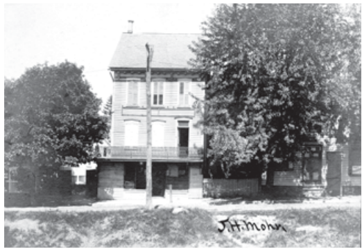
The Railroad House was located on Railroad Street where the parking lot is next to the Mercantile Club.

The Zimmerman Bakery was located on the northwest corner of Sixth and Walnut Streets. The bakery operated from the 1900s to the 1920s. The building was later converted into apartments and looks quite different today.