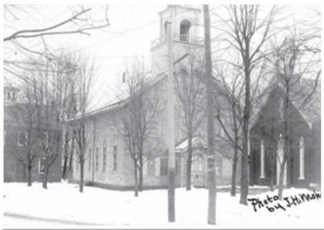
Photo shows Moravian Church and Chapel prior to the extensive renovations of 1926 when the Greek Revival portico was added and the chapel was united with the main church.