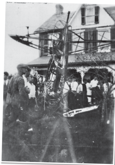
Plane crash in front yard of 41 South Second Street with a crowd

The plane hit the roof of 232 Main Street, just three doors west of his parents' house and right across the street from his own house. He immediately banked hard to the left (toward the railroad) and clipped the top of a small tree. Across the railroad, he made another sharp left turn and was then heading west to east. He flew over Knadler's corn field, but could not clear the power lines on South Second Street.