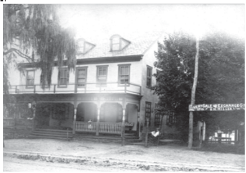
The Exchange Hotel was located on the southwest corner of Second and Main Streets. It was torn down in the 1930s.