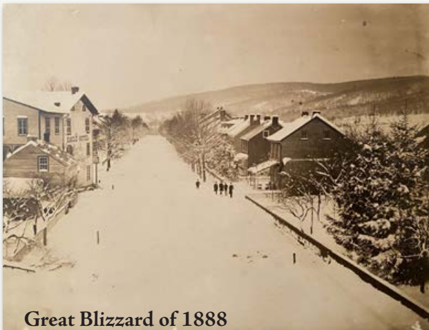
Great Blizzard of 1888