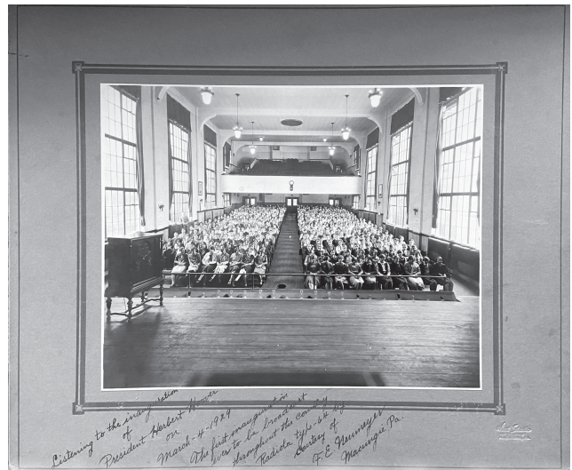
EHS Auditorium photo of Broadcast of Herbert Hoover Inauguration, March 4, 1929

The First Inauguration to be Broadcast Throughout the Country