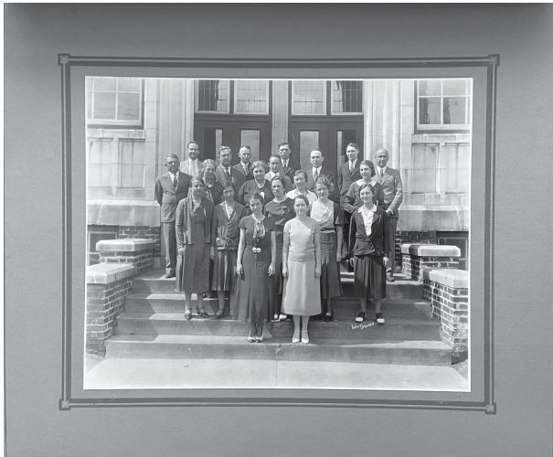
Late 1920's Emaus High Staff Group Photo