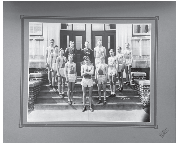
Boys Basketball Team Photo - circa 1931-1932