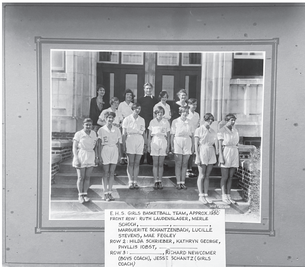
Girls Basketball Team Photo - 1930